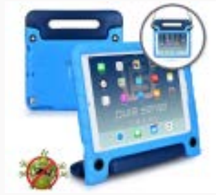
Case (Pure Sense Buddy)