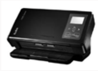
Kodak i1190[Note Model]