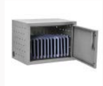
Charging Station with Lock