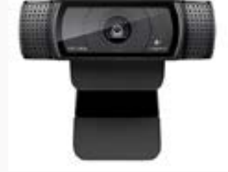
Logitech HD PRO Webcam C920