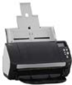
FUJITSU Image Scanner fi-7160

* All Scanning Devices and MUST use TWAIN Compliant Drivers