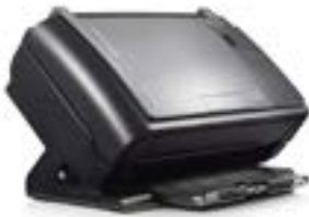
Kodak i2420 Scanner