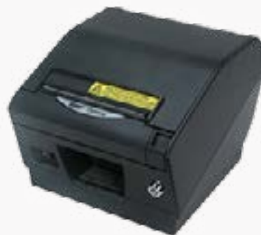
Star TSP800II or TSP800IIRx w/LAN Module (Network) w/USB Module (Individual)