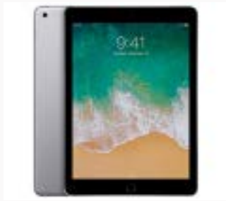
iPad 5th Gen or Higher minimum 9.7" iOS11 or higher