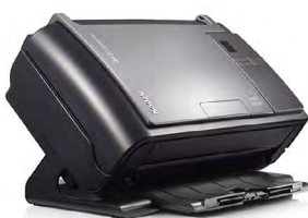
Kodak i2420 Scanner