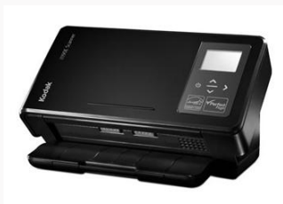
Kodak i1190[Note Model]