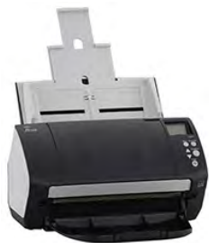
FUJITSU Image Scanner fi-7160

* All Scanning Devices and Cameras MUST use TWAIN Compliant Drivers