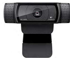
Logitech HD PRO Webcam C920