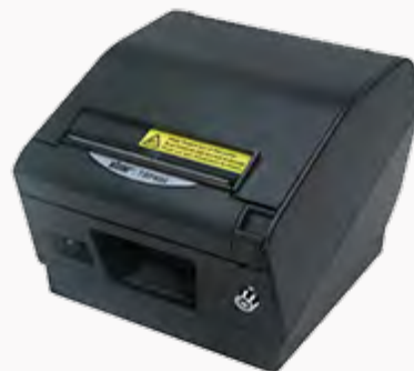
Star TSP800II or TSP800IIRx w/LAN Module (Network) w/USB Module (Individual)